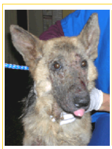
Dog with generalized demodicosis

Juvenile Onset -- Young dogs have inherently immature immune systems and are thus susceptible to the development of demodicosis without any sinister underlying diseases. As they grow up and their immune systems mature, they tend to naturally gain control of their mite infestation; in fact, 30-50% of dogs under one year of age recover spontaneously from generalized demodicosis without any form of treatment. Usually treatment is recommended, though, to facilitate recovery.